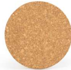
6.6" Circular Cork Trivet