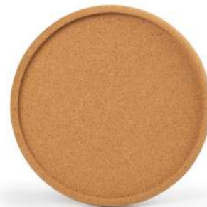
11.75" Circular Cork Tray