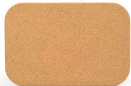
Rectangular Cork Cutting Board