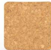
4" x 4" Square Cork Coaster