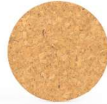
4" Circular Cork Coaster