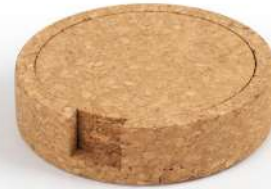
4/PKG Circular Cork Coaster Set