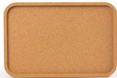
Rectangular Cork Tray